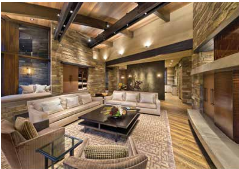
TOP: The interior of the great room of Green Fin was inspired by Frank Lloyd Wright's Wingspread. ABOVE: The dynamic curves and angular forms come together in the living area of Valhalla.

most of the portfolio remains in the resorts of the Rocky Mountains, Lake Tahoe, Nevada and Park City, Utah.